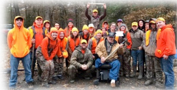
SVOC members and hunters during the Annual Rend Lake Deer Hunt for Individuals with Disabilities.