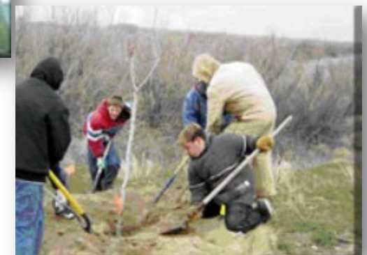
Eagle trees