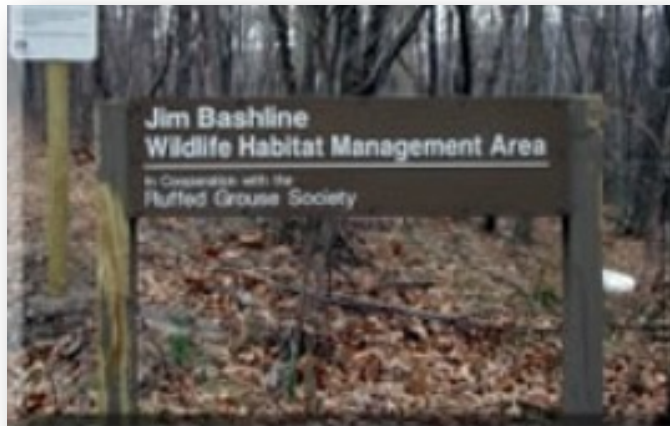
Raystown/Ruffed Grouse Society WMA

However, if the potential partner requests a local MOU as a condition to partner with the Corps, you may use the National MOU as a model example to create a local version.